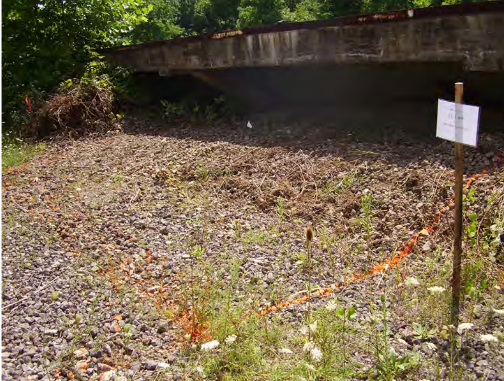
Excavation area to the east of Building CA-14 identified as containing smokeless propellant nodules prior to excavation.