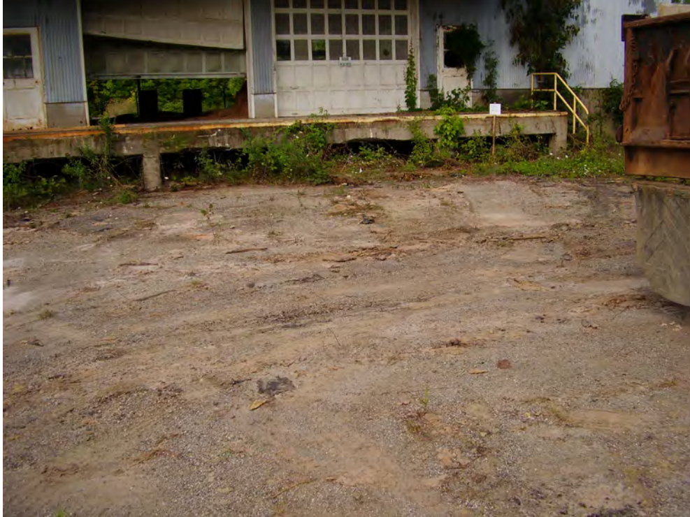
Excavation area to the east of Building CB-13B identified as containing smokeless propellant nodules prior to excavation.