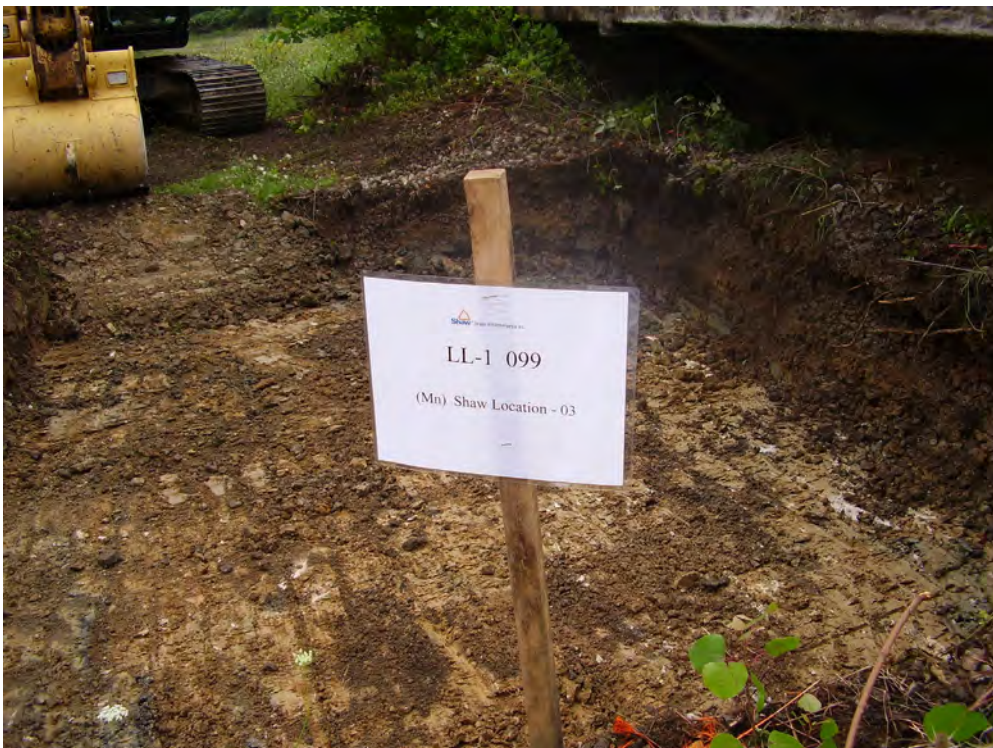
Post excavation area to the east of Building CA-14.