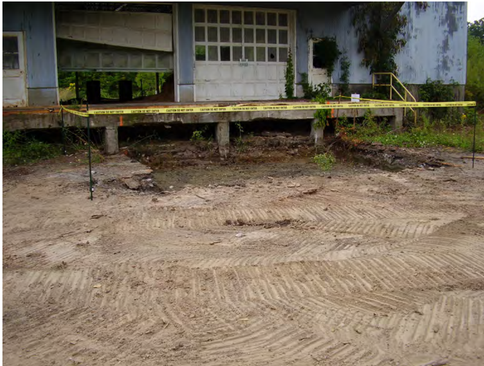
Post excavation area to the east of Building CB-13B.