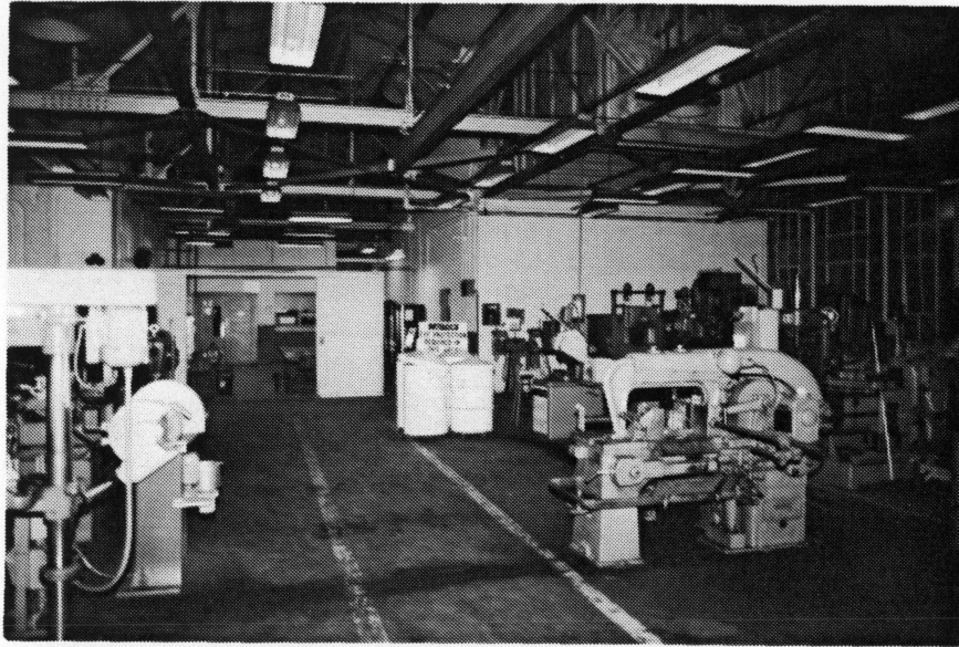
Figure 200. Building 1035: Interior view of a F.E. Maintenance Shop.