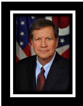
Governor John R. Kasich