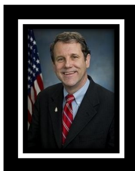
Senator Sherrod Brown (D) 713 Hart Senate Office Building Washington, D.C. 20510 Office (202) 224-2315