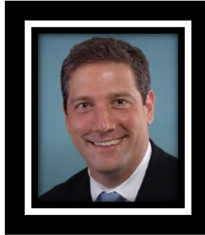
US Congressman Tim Ryan District 13 (D) U.S. House of Representatives 1126 Longworth HOB Washington, DC 20515 (202) 225-5261