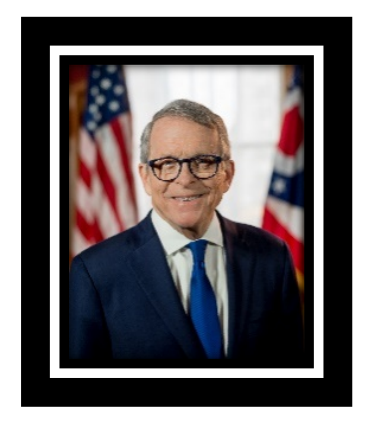
Governor Mike DeWine